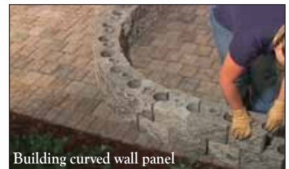
Building curved wall panel