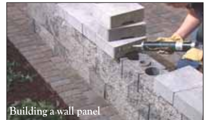
Building a wall panel