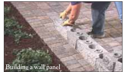
Building a wall panel

*Note: Walls must be built on a solid foundation. See How-To sheet #120 at allanblock.com for more information. AB Courtyard can be installed directly on patios or other pavement. Some blocks will need to be split, see How-to sheet #100 for more information. Can not be used to retain soil.