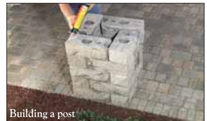
Building a post